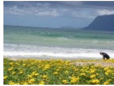
Beautiful walks on the beach

Become a proud owner of a classic and sophisticated apartment on one of the most well known and historical beachfront miles in Africa