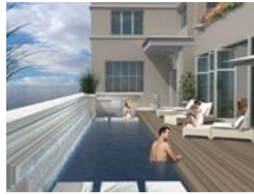
Lap pool /water feature on terrace