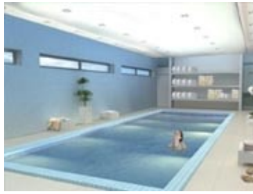
In-house heated pool at sauna area